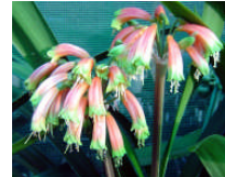
C gardenii 'Everton Falls'

C gardenii: Fast growing species with pendulous flowers in Autumn, May/June. Clump rapidly. Plants are 30-36 months old and should flower in 2011.