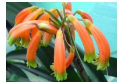
C gardenii "Eshowe"

Price: $12.50 each (Discount of 20% on orders 10 or more plants). Prices for larger plants available on request.